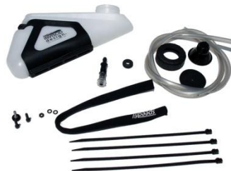
Speedfil Aero Hydration for Race Bikes

AND NOW: CUSTOM ITALIAN RACING BIKES BY JAVELIN