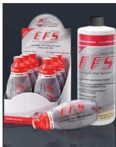
1 ST Endurance Sports Nutrition

SEE OUR WEB STORE AT WWW.SPORTFIT-LAB.COM