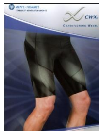
Women's and Men's CW-X Compression Wear